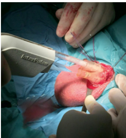
b) High pressure saline washout