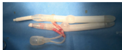
Fig 1. Mechanical malfunction due to bilateral cylinder aneurism

The cause of the mechanical failure can be different depending on the type of virgin IPP. With the use of last generation IPP, the cause of mechanical failure is mainly tubing fracture (67.5%), being less frequent other alterations as the cylinder aneurism, reservoir hernia and pump malfunction (10.4%) (9). In other series, with older devices, the main cause of mechanical failure is the cylinder leak (45%) followed by the tubing leak/break (13%) or the fluid loss not otherwise specified (20%) (10). But in any case, the final diagnosis will be based on the intraoperative findings.